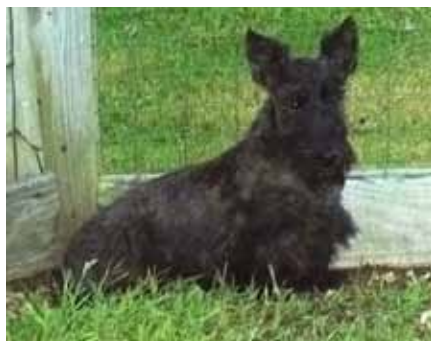
Georgia who is up for adoption!

P.S. Looking forward to our STCNE Banquet. 1PM Publick House Inn Sturbridge, MA November 14, 2010. Save the date.