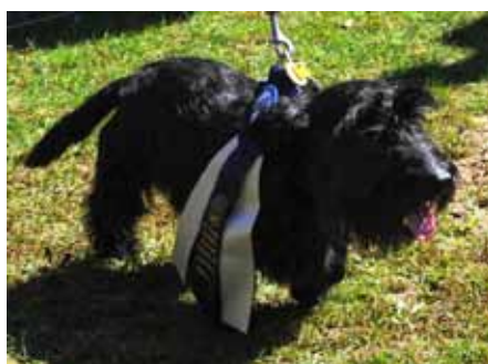
Happy Scottie with a Rescue Ribbon